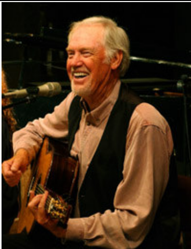
Ronny Cox, actor from movies like Deliverance , Beverly Hills Cop , and Total Recall , will headline the January Coffeehouse on 1/21. Reserve your seat early by pre-paying at the delfolk.org web-site!

*Pricing is for Members / Non Members. Half price for ages 13-18; Free for Wesley students and children 12 and under.